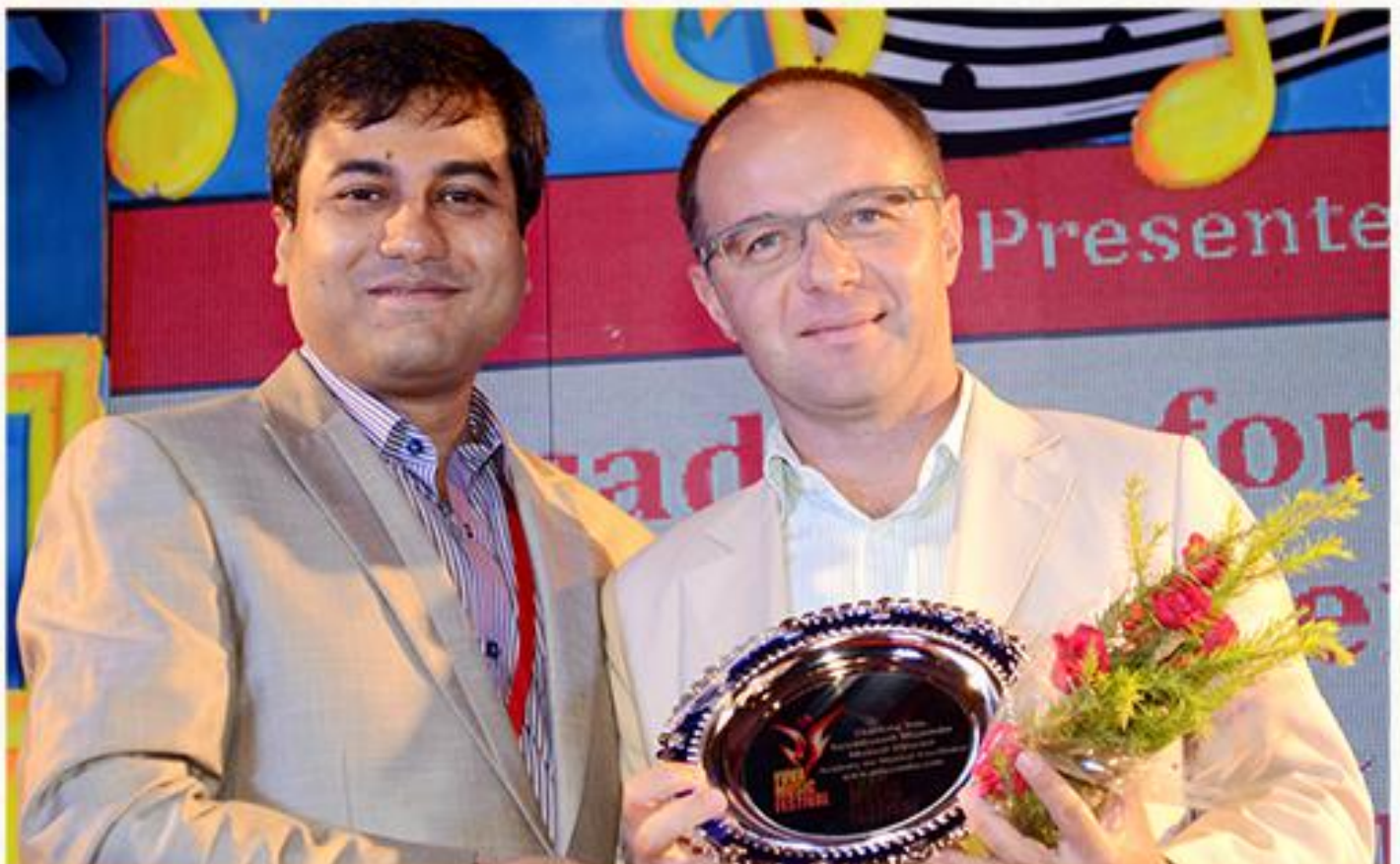
Mr Cesare Bieller, Hon'ble Consul General of Italy

Gone are the days of buying expensive books for the sake of examinations. The digital revolution has ushered in many new opportunities. One significant example is to purchase online. Candidates may select their favourite items from various renowned publications and digital platforms. Education should be fun and not an expensive affair. Millions of candidates across the globe are joyfully performing their favourite items for assessment. A new approach apt for 21st-century music and arts education.