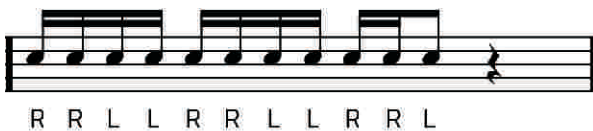
Eleven Stroke Roll