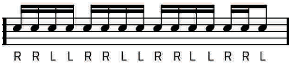
Fifteen Stroke Rol